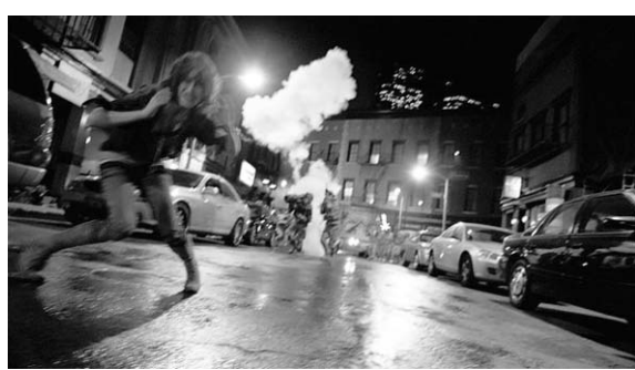
Theaters showing "Cloverfield" are posting warnings of possible motion sickness.