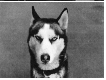
EACH A TYPE: Ferocious guard dog, smart husky, elegant Russian wolfhound

based on their personalities, when they're stressed out or frightened. Putting personality testing – already a thriving business – on a firm footing could uncover a wealth of knowledge about where personality comes from.